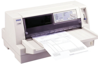
Epson LQ-680 Pro